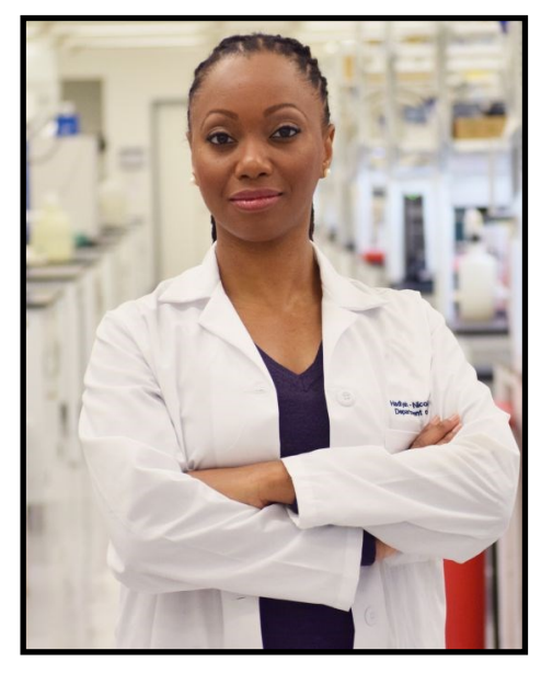
Dr. Hadiyah-Nicole Green leads research that explores lasers in cancer treatment.

GMaP Region 2 looks forward to continuing to highlight the accom-